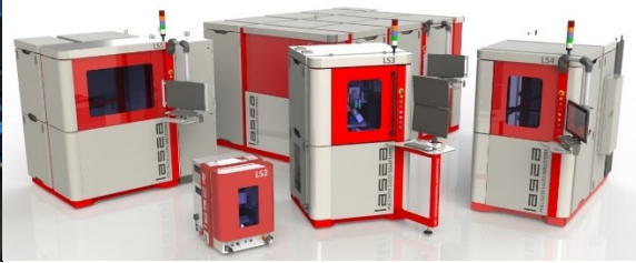
Laser processing equipment